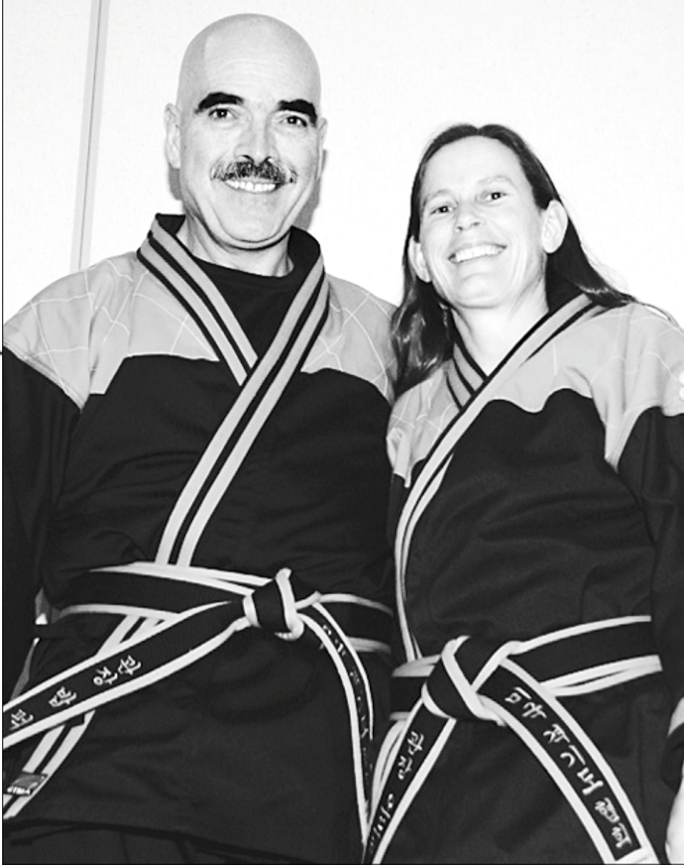
CHAMBER PHOTO Good Neighbors

For more information, call (262) 743-2111.